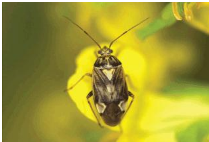
Figure 1: Adult L. lineolaris (5-6 mm long) (photo: AAFC-Saskatoon).

Adult: In western Canada, four species Lygus lineolaris (tarnished plant bug), L. borealis , L. elisus and L. keltoni have been observed in canola (Figure 1). Adult lygus bugs are 5-6 mm long and 2.5 mm wide. They vary in color from pale green to reddish brown and have a distinct triangle or "V" shaped mark on the back. Adult lygus bugs overwinter under litter, debris, or plant cover in shelterbeds, headlands and field margins. In the spring adults become active and feed on early-growing plants. Lygus bugs utilize a wide range of host plants that are available sequentially through the season. Adults start to lay eggs in mid-May in the southern prairies and in mid-June in the Peace River region. Eggs are inserted individually into the stems (Figure 2) and leaves of host plants. Egg laying usually lasts 3 weeks but may continue for up to 7 weeks and may vary depending upon the host crop and duration of the growing season.