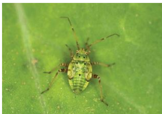
Figure 3: Fifth instar lygus bug nymph (3-4 mm long).

Damage: Lygus bugs have piercing-sucking mouthparts and physically damage the plant by puncturing the tissue and sucking plant juices. The plants also react to the toxic saliva that the insects inject when they feed. Lygus bug infestations can cause alfalfa to have short stem internodes, excessive branching, and small, distorted leaves. They feed on buds and blossoms and cause them to drop. They also puncture seed pods and feed on the developing seeds causing them to turn brown and shrivel.