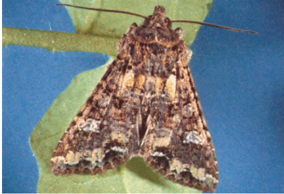
Figure 1: Adults- 1-5 days