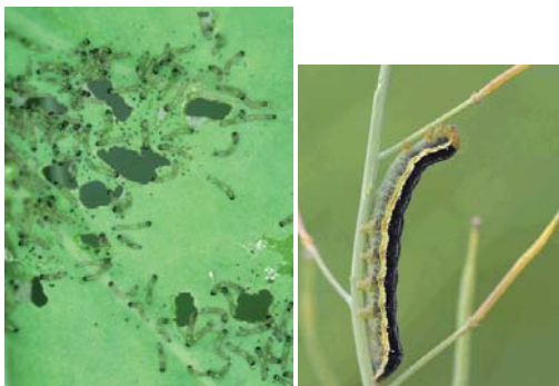
Figure 3: Larvae- 6 weeks

Bertha armyworms survive the winter as pupae in the ground at depths of 5 to 16 cm. Pupa is reddish brown and about 1.8 in size (Figure 4).