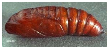
Figure 4: Pupa- overwinter